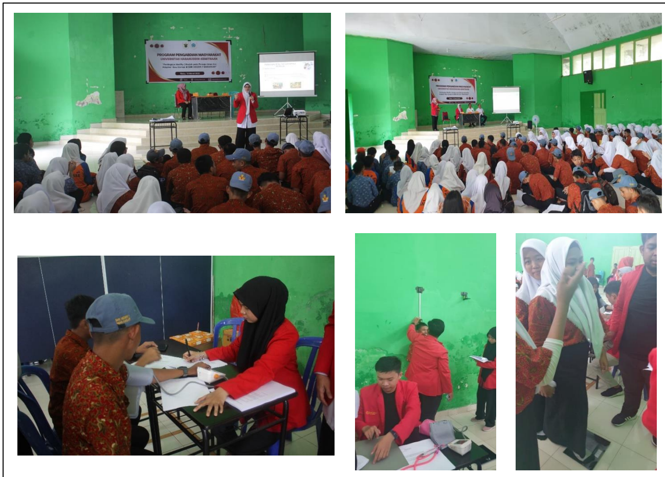
Figure 3. Community service activities