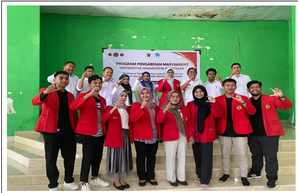
Figure 2. Community service team